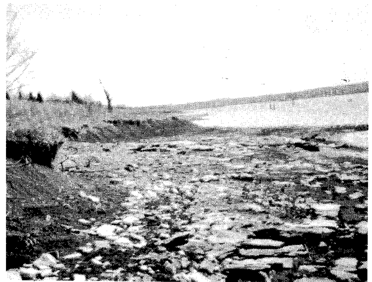
Shoreline erosion on Patoka Lake

Our comments point out the clear contradiction between RDA's rural development mission and FmHA's environmental mission. NEPA regulations require FmHA to assist farms and rural towns by protecting "important farmlands and forestlands, prime rangelands, wetlands, and floodplains" (7 CFR Ch. XVIII § 1940.304). These resources are considered so important and sensitive by FmHA that limiting cumulative effects of FmHA programs on land use in the United States is the purpose of FmHA's environmental program: "The Nation's farmlands, forest lands, rangelands, flood plains, and wetlands are unique natural resources providing food, fiber, wood, and water necessary for the continued welfare of the people of the United States and protection from floods. Each year, large amounts of these lands are converted to other uses. Continued conversion of the Nation's farmlands, forest lands, and rangelands may impair the ability of the United States to produce sufficient food, fibers, and wood to meet domestic needs and the demands of export markets. Continued conversion of the Nation's wetlands may reduce the availability of adequate supplies of suitable-quality water, indigenous wildlife species, and the productive capacity of the Nation's fish-